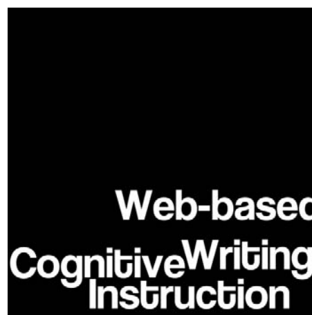
Fig. 1 The official logo of Web-based Cognitive Writing Instruction (WeCWI)

The transformation of information accessed from “page” to “web” in instructional technology has brought the language instructors entering into the biggest linguistic revolution ever on the phonetic, lexical, syntactic, standards of language, as well as the use of “correct” language [4]. Similar to what [5] had emphasised, knowing English well also necessitates the skills of knowing how to read, write, and communicate in digital era. Techniques of manipulating and creating your own web materials, as well as methods of integrating web activities into ELT have become the fundamental skills of instructors in universities. For instance, one of the 21st century digital skills every instructor should possess is using a blog to create an online teaching platform [6]. Additionally, a blog is also one of the 40 must-know web 2.0 edutools [7]. Through blogging, students are also regarded as the 21st century literate netizens [8].